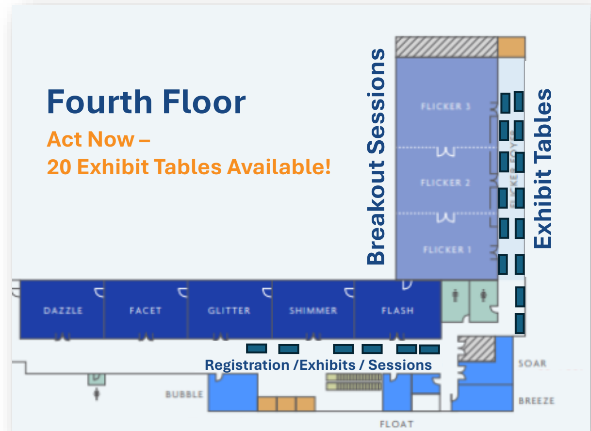
Diagram Subject to Change

Will be included in your confirmation email.